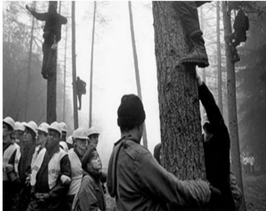
Between 1992 and 1997 opposition to the government's road building scheme led to massive protests, such as here at the site of the Newbury Bypass.

With a government seemingly intent on pushing through the latest road-building programme via its localism agenda campaigners are readying themselves for combined resistance using legal experts, alliance groupings and direct action